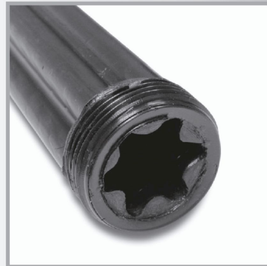
Rura gwiazda PE zakończona gwintem 1\frac{1}{4} The PE star pipe with end a 1\frac{1}{4} thread