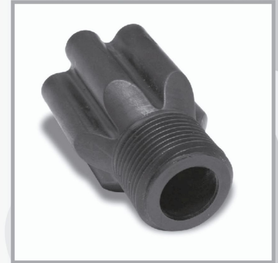
Przeście gwiazda PE 40 na gwint \frac{3}{4} Switching the PE 40 for thread \frac{3}{4}