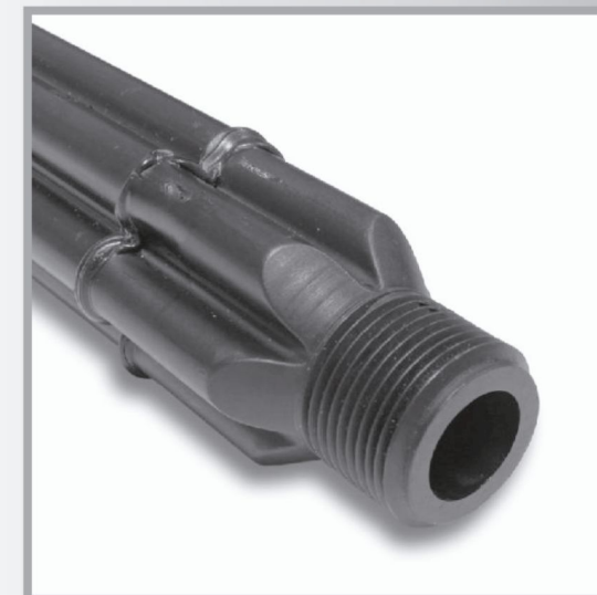
Przeście gwiazda PE 40 na gwint \frac{3}{4} Switching the PE 40 for thread \frac{3}{4}