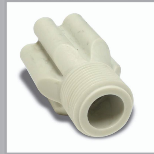
Przeście gwiazda PP-R 40 na gwint \frac{3}{4} Switching the PP-R 40 for thread \frac{3}{4}