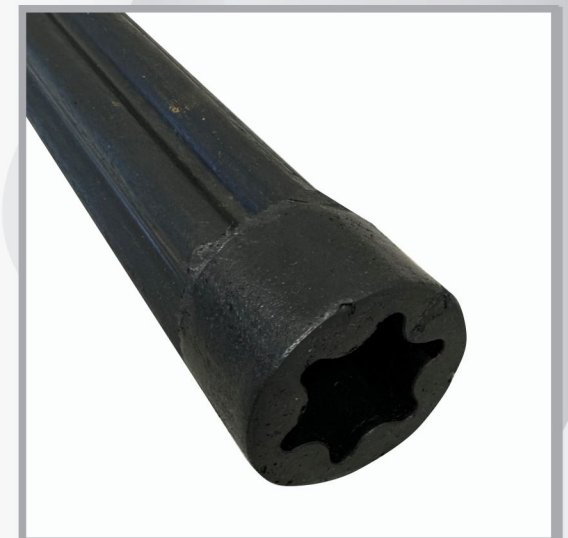
Rura gwiazda PE \varnothing 40 PE pipe star \varnothing 40