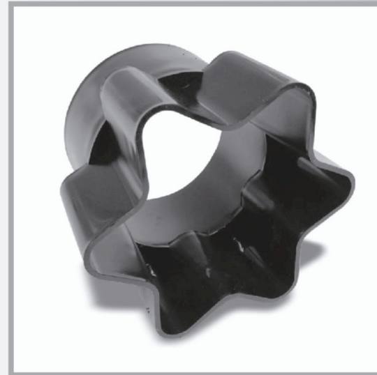
Przeście gwiazda PE 250 na okrągłą \varnothing 200 Switching the PE 250 from star to a round \varnothing 200