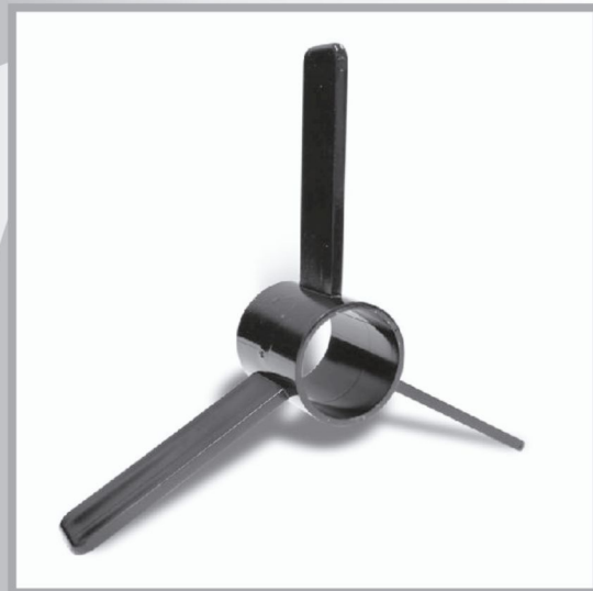
Podpora wewnętrzna do rury PP-R 40 Inner support for PP-R 40 pipe