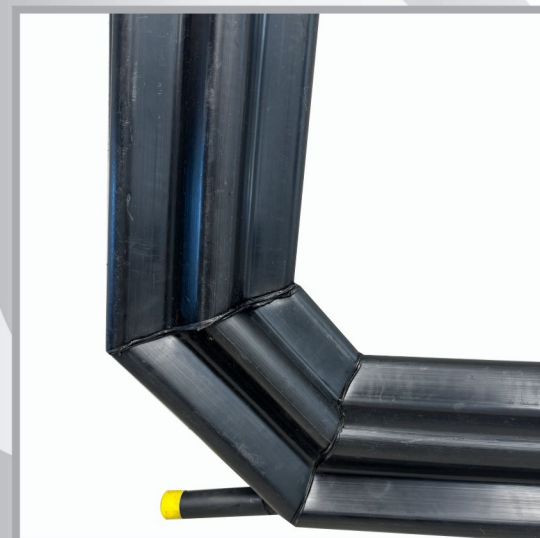
Kolano 90° PE 250 do powietrza