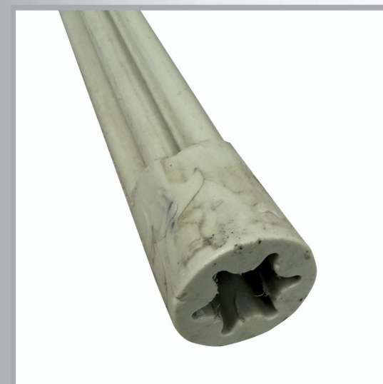
Rura gwiazda PP-R \varnothing 40 Star pipe PP-R \varnothing 40