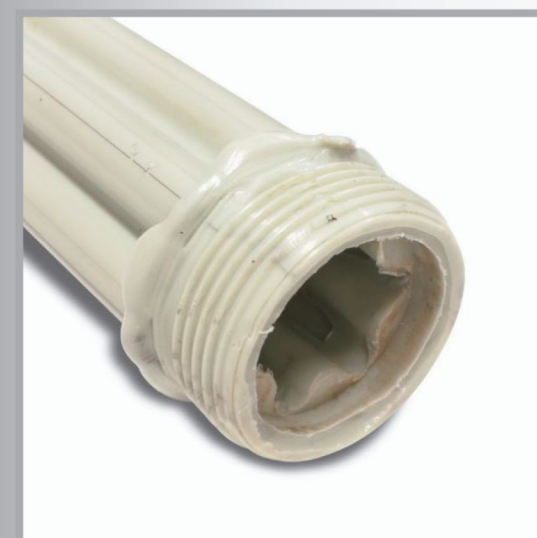
Rura gwiazda PP-R zakończona gwintem 1\frac{1}{4} The star pipe PP-R ended with a 1\frac{1}{4} thread