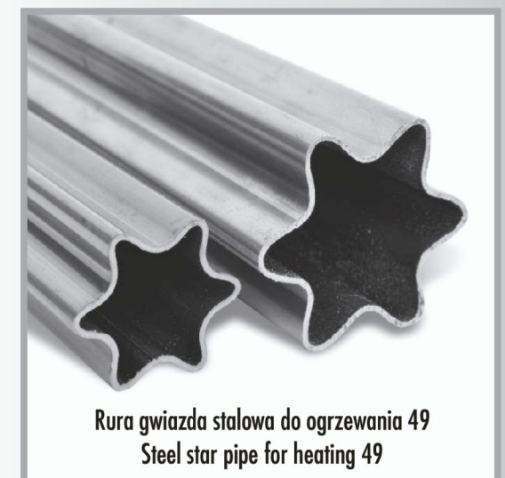
Rura gwiazda stalowa do ogrzewania 49 Steel star pipe for heating 49